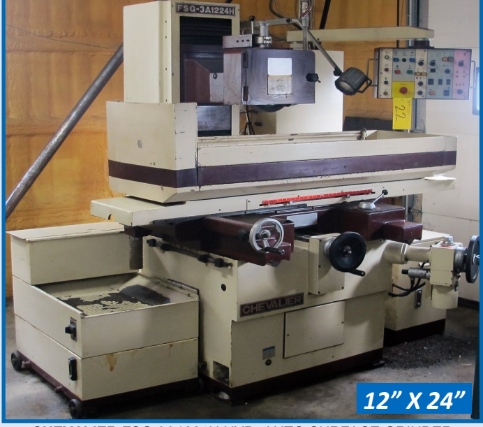
CHEVALIER FSG-3A1224H HYD. AUTO SURFACE GRINDER

Online Auction Only: Bidding Closes Tuesday April 9th, 11:00AM (ET)