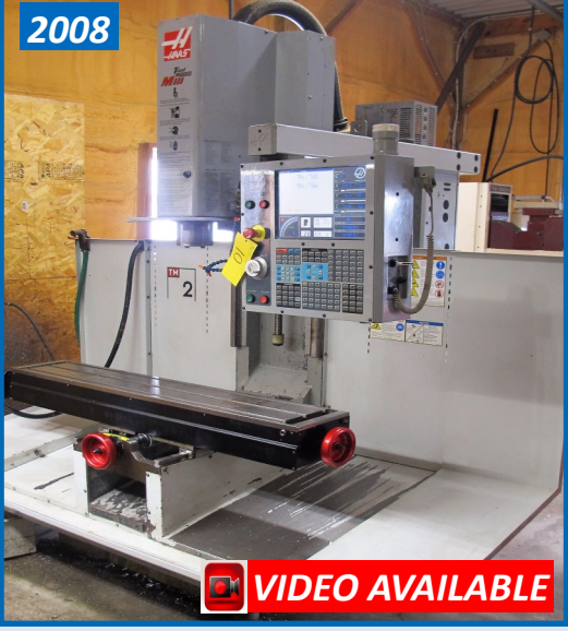
HAAS TM-2 CNC VERTICAL MILLING MACHINE